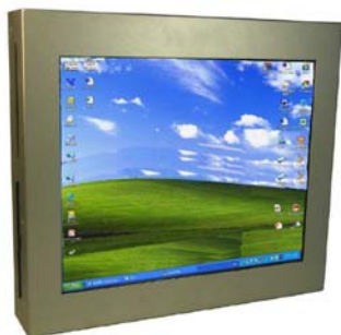
LCM-170T Front view