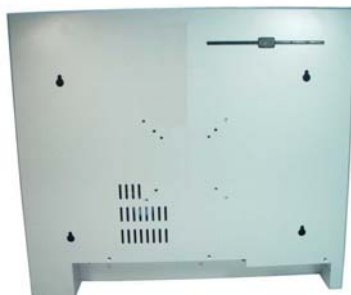
LCM-170T Rear view (with OSD buttons)