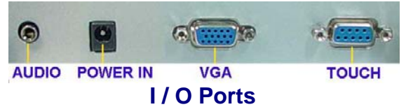
I / O Ports