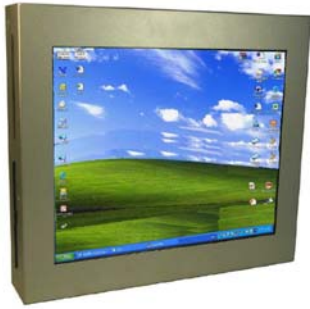
LCM-170T Front view