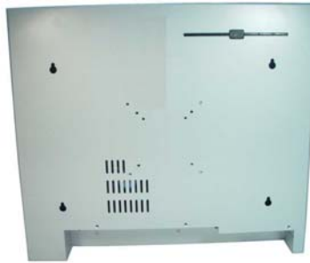
DM-170Chassis Rear view (with OSD buttons)