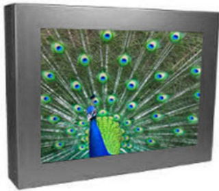
DM-170Chassis Front view